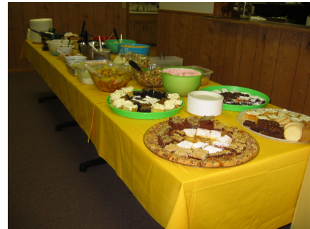
Lots of good food