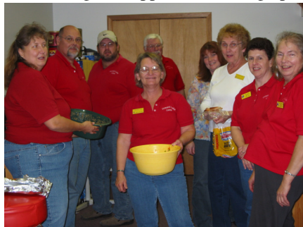
A fine looking group of workers